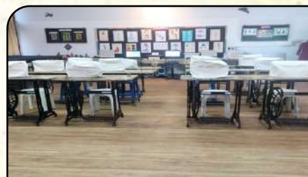
Fashion Designing Lab