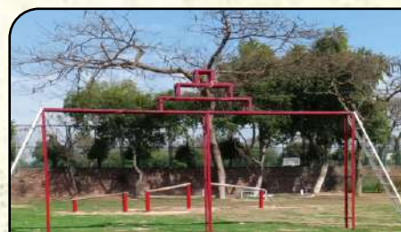
SSB Training Centre