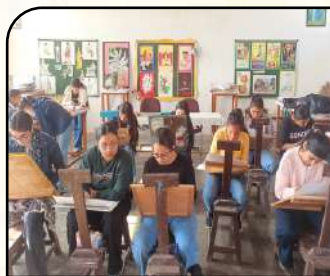
Fine Arts Lab